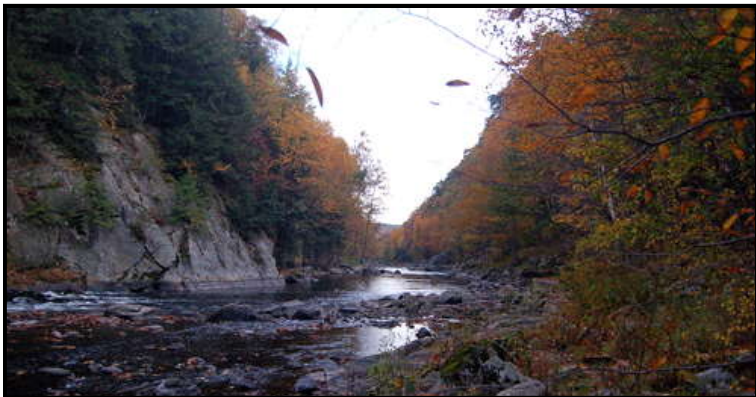
Farmington River, Connecticut

OUR NEXT MEETING WILL BE ON May 28th, streamside. (at the Check Station)